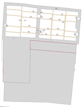
ATTIC FLOOR PLAN

Notes: 1. The information on this drawing is for reference only. 2. The information on this drawing is for reference only. 3. The information on this drawing is for reference only. 4. The information on this drawing is for reference only. 5. The information on this drawing is for reference only. 6. The information on this drawing is for reference only. 7. The information on this drawing is for reference only. 8. The information on this drawing is for reference only. 9. The information on this drawing is for reference only. 10. The information on this drawing is for reference only.